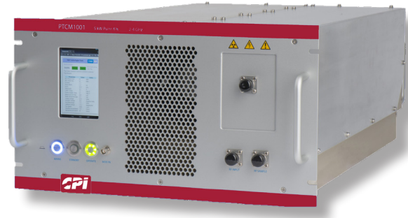
Example PTCM: Can be supplied with or without LCD screen

To learn more about CPI EDB's instrumentation amplifiers capabilities, contact CPI EDB at ElectronDevices@cpi-edb.com or call +44 (0)20 8573 5555