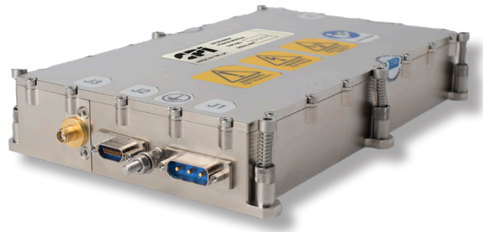
The PTXM1052 is an ultra-compact modular microwave power module with an integrated “super mini” travelling wave tube (TWT)

To learn more about CPI EDB’s MPM capabilities, contact CPI EDB at ElectronDevices@cpi-edb.com or call us at +44 (0)20 8573 5555